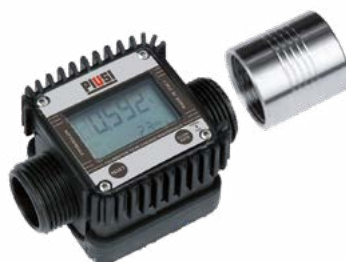
K24 plastic version