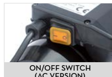
ON/OFF SWITCH (AC VERSION)