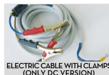
ELECTRIC CABLE WITH CLAMPS (ONLY DC VERSION)