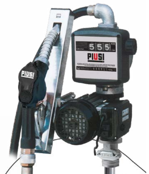
DRUM PANTHER 56 K33