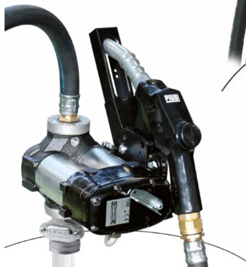
DRUM BIPUMP 12V