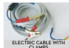
ELECTRIC CABLE WITH CLAMPS