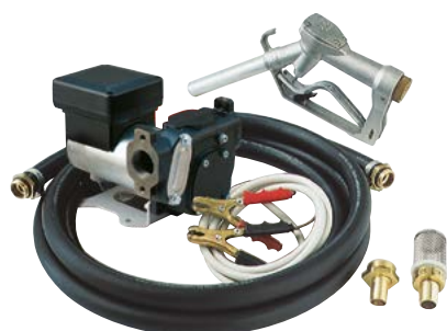
BATTERY KIT PANTHER