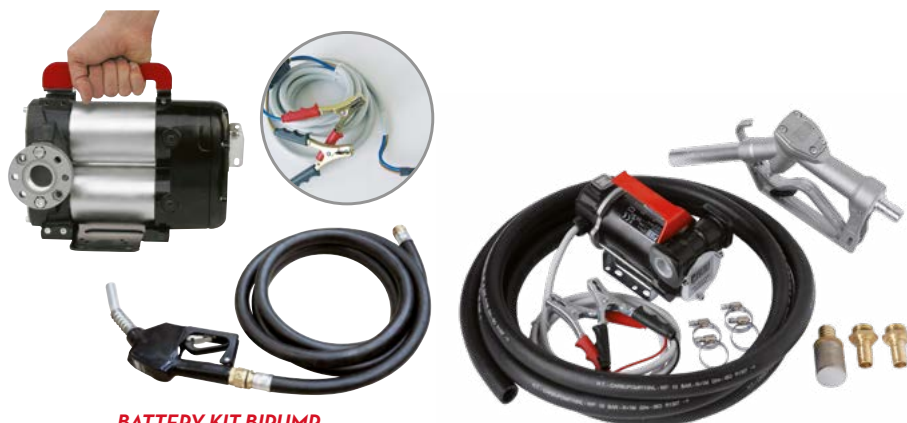
BATTERY KIT BIPUMP