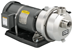
CLOSE COUPLED ELECTRIC

CHEMICALS / WASTES / ACIDS INDUSTRIAL LIQUIDS / OILFIELD AQUACULTURE / AGRICULTURE