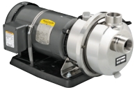
CLOSE COUPLED ELECTRIC

Pump constructed with stainless steel housing. Glass reinforced internal parts, stainless steel housing clamp and internal fasteners, EPDM elastomers and check valve, polypropylene baseplate with close-coupled electric motors, and steel baseplates with close-coupled hydraulic models. Motor shafts are extended with 316SS shaft adapter. Consult factory for polypropylene and Ryton® internal components